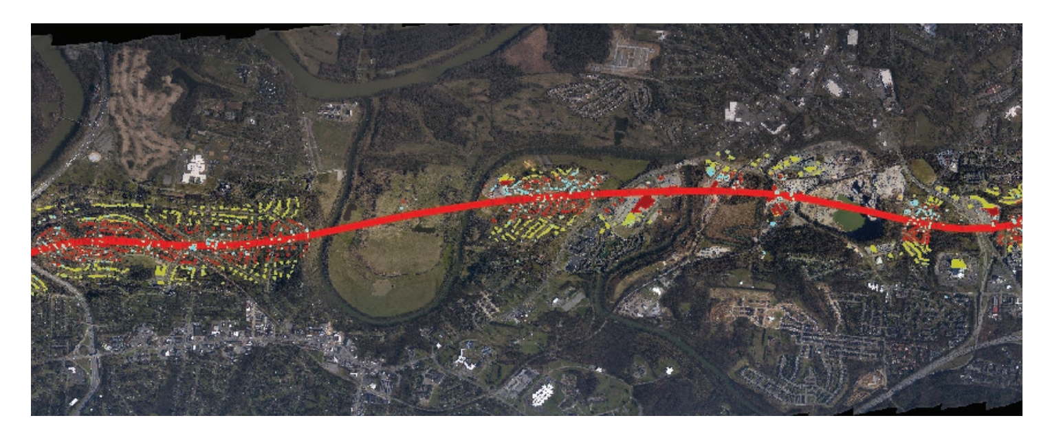
L3Harris Geospatial applied deep learning technology to airborne images captured over Nashville, Tennessee, following a deadly March 2020 tornado. Using the ENVI Deep Learning module, which is offered as an extension to ENVI geospatial analysis software, technicians identified where building damage had been inflicted by the tornado and charted its precise path of destruction from the aerial photos – in less than two hours.